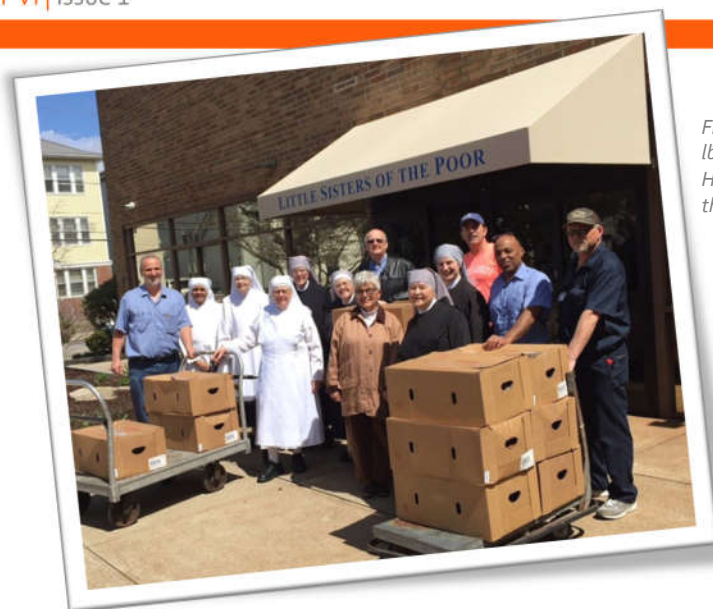
Fr. Donnally Council delivers 950 lbs. of ham for the 2019 Easter Ham Drop to the Little Sisters of the Poor.