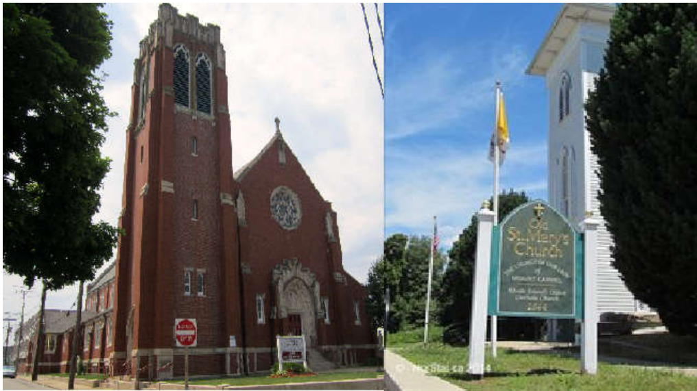
SS John and James parish merges with St. Mary's in West Warwick, but the Knights of Columbus have already led the way in their fraternal efforts to unify their Councils.