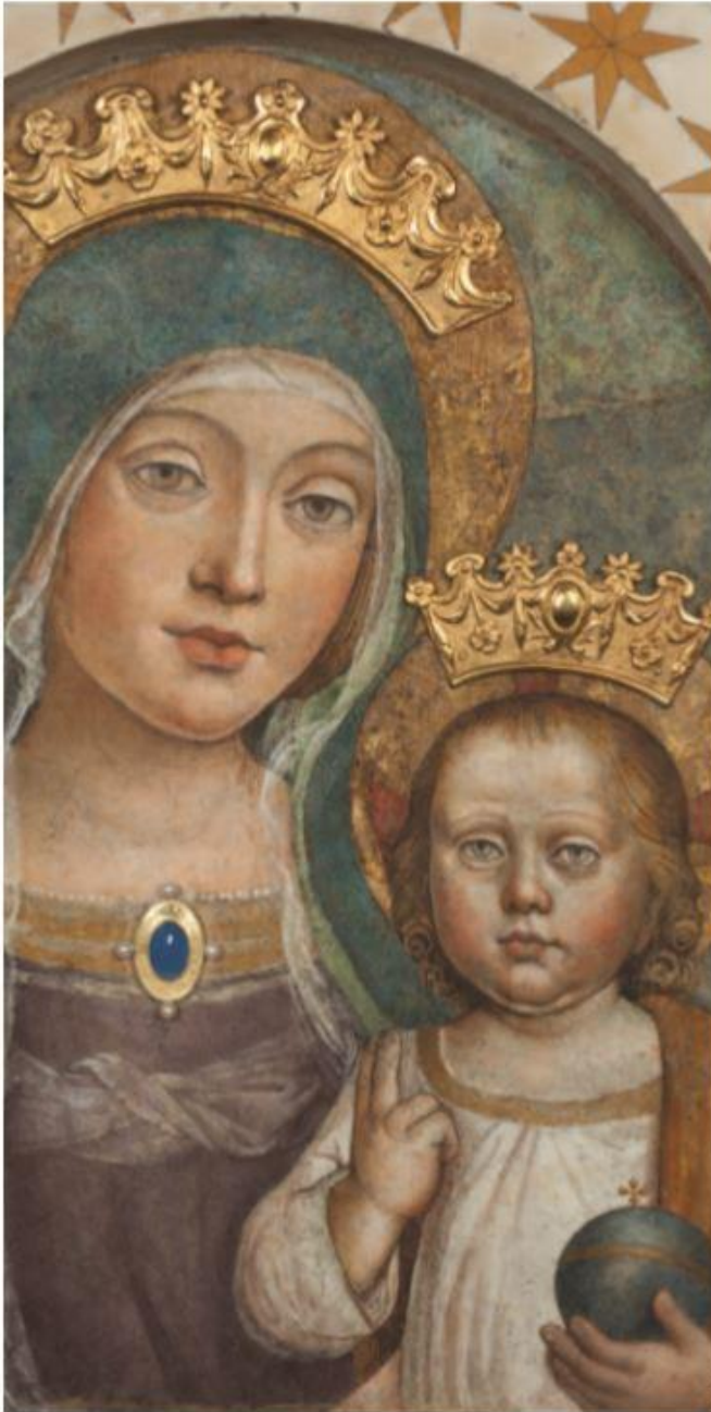
The ancient fresco of Madonna del Soccorso (Our Lady of Help) in St. Peter's Basilica was restored with the support of the Knights of Columbus to mark the Year of Faith (2012-2013).

O Mary, you always brighten our path as a sign of salvation and of hope. We entrust ourselves to you, Health of the Sick, who, at the Cross, took part in Jesus' pain while remaining steadfast in faith.