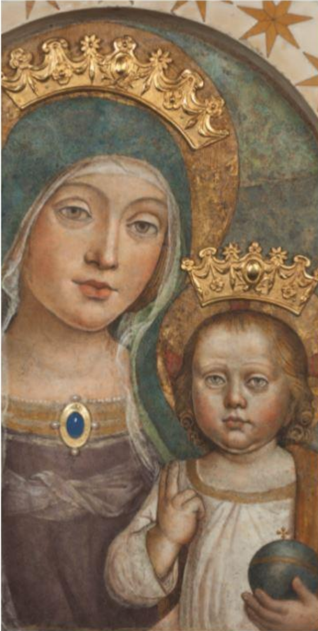
The ancient fresco of Madonna del Soccorso (Our Lady of Help) in St. Peter's Basilica was restored with the support of the Knights of Columbus to mark the Year of Faith (2012-2013).

O Mary, you always brighten our path as a sign of salvation and of hope. We entrust ourselves to you, Health of the Sick, who, at the Cross, took part in Jesus' pain while remaining steadfast in faith.