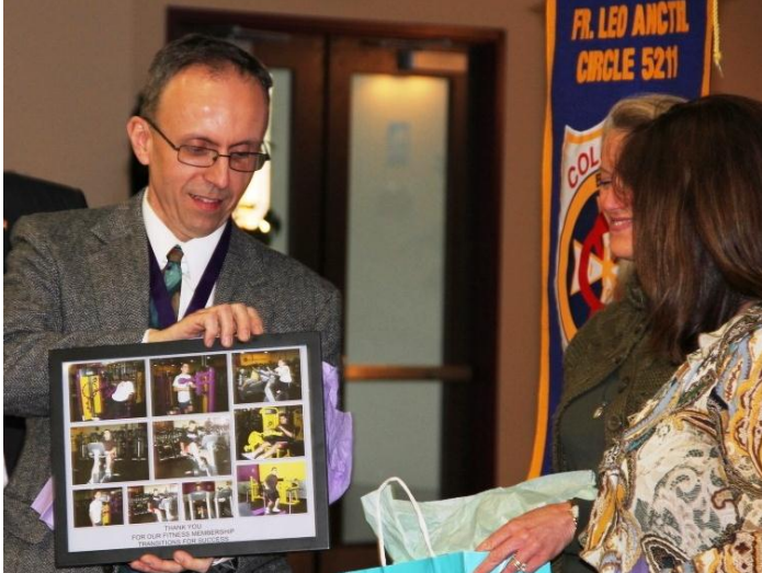
Blessing Council donation to Transitions for Success