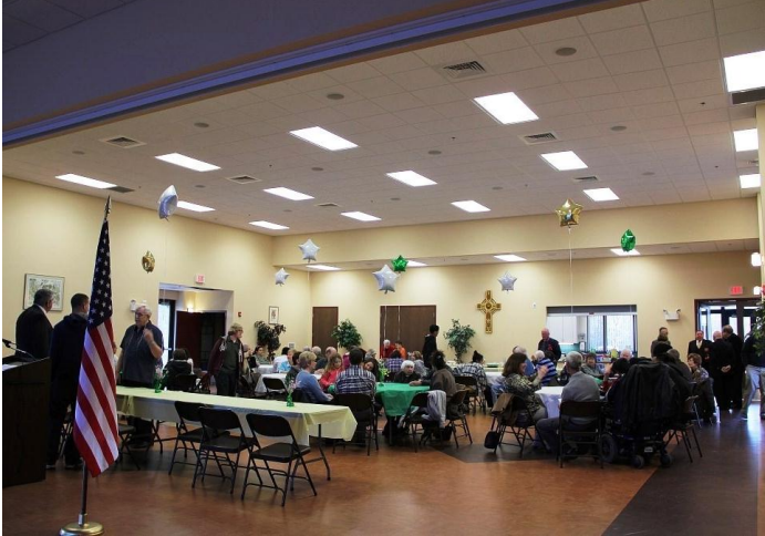
More photos can be found on the Council and Squires Facebook page. Search on "Monsignor Peter E. Blessing Knights of Columbus Council" or "Fr. Leo Anctil Columbian Squires Circle."