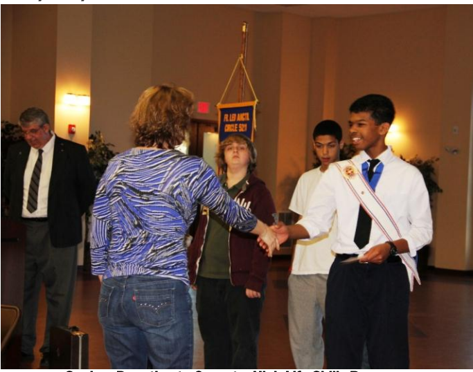
Squires Donation to Coventry High Life Skills Program